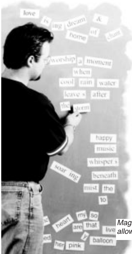
Magnetic Poetry Paint in action. Our non-toxic primer allows any porous surface to hold magnets.

Take a look at a scattering of word tiles, and pick one without pointing to it or touching it. Then ask the child to find that word (ala "Where's Waldo?").