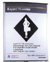
Silver: Silver Frame Silver Post