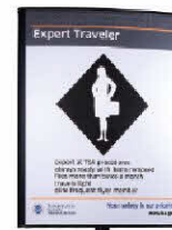
Black: Black Frame Black Post