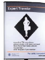
Basic: Silver Frame Black Post