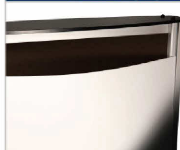
Printed Rigid Sign: Graphics are printed directly onto PETG and laminated to prevent scratching. Ideal for more permanent signage.