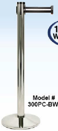
Model # 300PC-BW