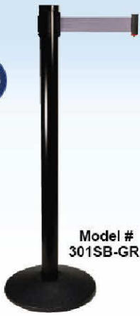
Model # 301SB-GR

Often imitated, but never duplicated... The original Retractable-Belt®.