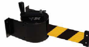
Manual Retracting - 50' WM5000-BYD