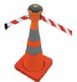
Cone Mounted: 28'6" SKIP-RW + CONE3042ERC + CONEW77