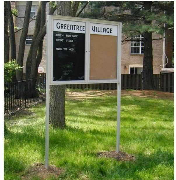
Model PML For Outdoor Use Standard Length: 120"