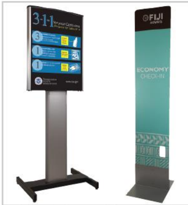
Large Format Sign Stands