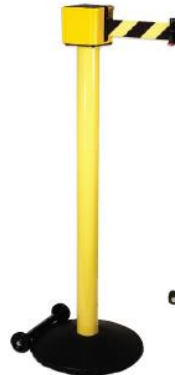
30' Post PM412-30