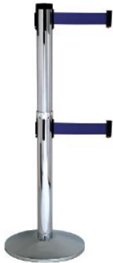
Dual Line Post 300D/301D