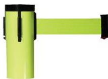
15' Retracta-Cone Cone Topper RC15