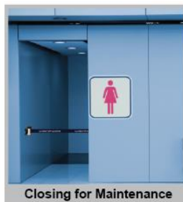
Closing for Maintenance