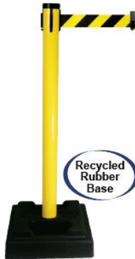
Utility Post 302/322