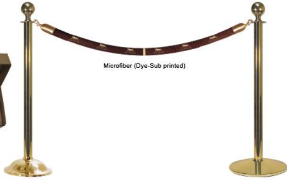
Microfiber (Dye-Sub printed)