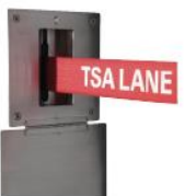
Recessed Wall Mount