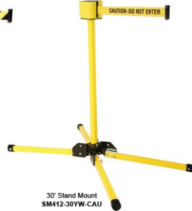
30' Stand Mount SM412-30YW-CAU