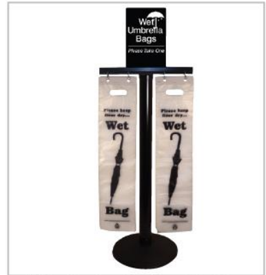
Wet Umbrella Bag Holder