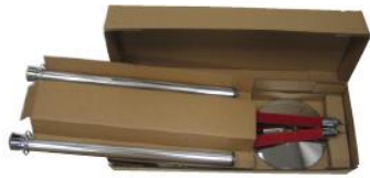
Two Posts, One Free Rope... Ships Knocked-Down In One Box Queue-in-a-Box (select styles)