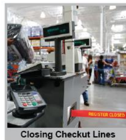
Closing Checkout Lines