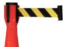
10' Retracta-Cone Cone Topper RC10