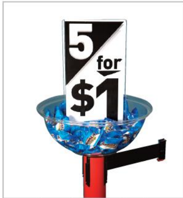
Impulse Buy Bowl