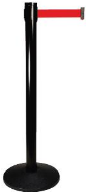
Single Line Post 300/301