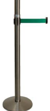
6' Tall Post 360/361