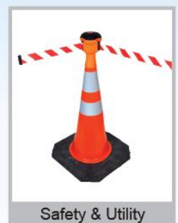
Safety & Utility