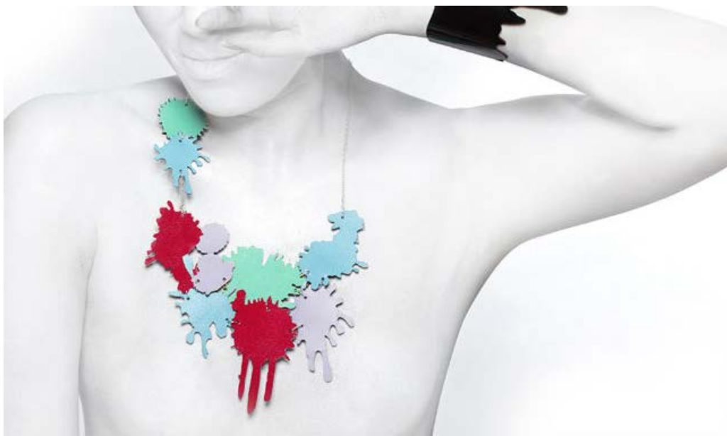
Slap Necklace and Spill Cuff