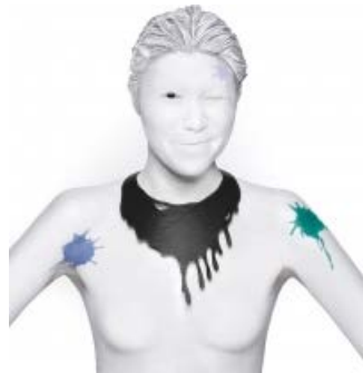
Slip Bib Necklace

Singapore jewelry brand Carrie K. Artisan Jewellery will unveil its new jewelry collection inspired by the works of Jackson Pollock at Tranoï F/W 2013, starting tomorrow in Paris .