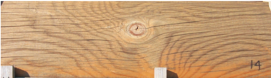
Fissuring of Log Siding

Round log siding probably presents the greatest challenge to forestalling the effects of weathering. Typically used in high exposure locations such as dormers and gable ends, in addition to suffering the same weathering characteristics as round logs, log siding has some features which makes it even more difficult to protect from the effects of the weather. Siding is often manufactured from lower quality wood than logs, frequently using green wood. This makes it more susceptible to twisting, warping and cracking. Since siding does not have the high thermal mass of full logs, during the summer months their temperature can range from 80° F to 160° F or higher during the course of one day. This puts a lot of mechanical stress on both the siding and its finish system resulting in small fissures forming on the surface. Rainwater can then enter these fissures and get behind the finish.