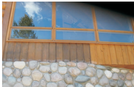
Section on left was wire brushed.