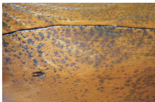
Metallic tannate discolorations from unknown source.