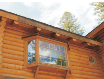
Section of fascia that was wire brushed.