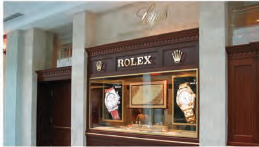
SOUTH SHORE South Shore Plaza • Braintree, MA 781.356.5300