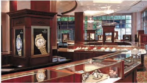
DOWNTOWN BOSTON 100 Summer Street • Boston, MA 617.426.8500