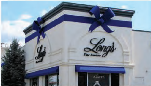
BURLINGTON AREA 60A South Avenue • Burlington, MA (across from the mall) 781.272.5400