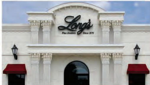
METROWEST 323 Speen Street • Natick, MA (outside the mall, across from Neiman Marcus) 508.650.2900