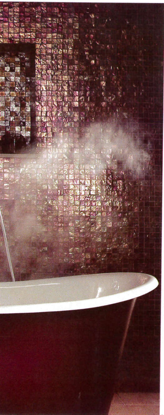
Above left: Interceramic's Slate Supremo tile in a contemporary installation. Below left: Oceanside Glass Tile's jewel-like blends create a spa atmosphere. Below: Laticrete grout works well in bathroom areas.

Once the glass tile is placed, the right grout finishes the look. LATICRETE SpectraLOCK PRO Premium Grout is a high-performance epoxy grout which offers excellent color choice and uniformity, durability, stain protection and beautiful, full grout joints in an easy-to-use formula. This grout is stain proof, inhibits mold and mildew, and is tough, durable and crack resistant. And it comes in high-fashion colors with the unique SpectraLOCK Dazzle component. >>