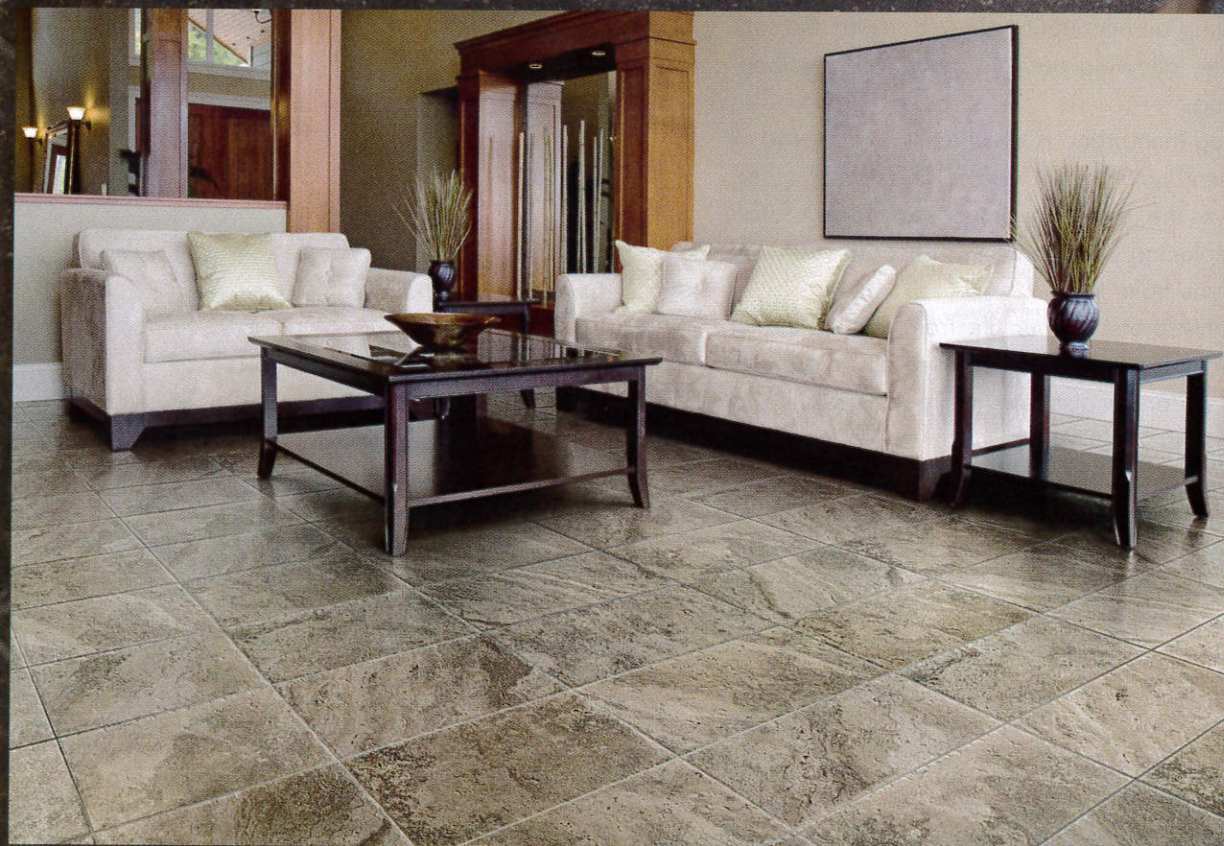
As realistic as stone with all the benefits of tile, here are Marazzi Tile's Archeology large-format tiles in Crystal River. Background: Crossville's Bluestone tiles work well with organic room elements.

And then, there are the mosaics. Responding to homeowners', interior designers' and architects' recognition that contemporary tile mosaics are accessible to all, mosaics have moved from the palazzo into our homes. Whether you choose a traditional hand-made selection like Lilywork Tessellation or the latest shimmering blends of Oceanside Glasstile Tessera, mosaics are an affordable design element that updates and elevates your décor. To help you visualize your dream mosaic, tile companies have tools that lead you through the mosaic design process. >>