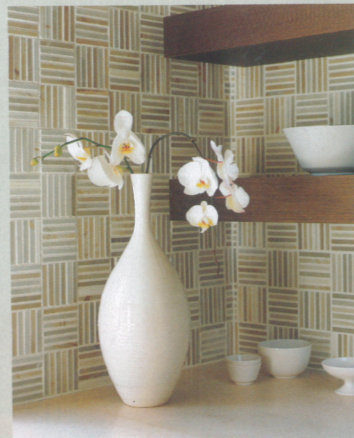
Walker Zanger honors the creator of Fallingwater with its Waterfall Collection of mosaic tiles crafted of honed slate and iridescent marbled glass. Available in a multitude of formats and colors, the Waterfall Collection imparts an organic feeling of luxury to any room it graces. Shown above is Waterfall Weave in Woodridge.

The tile collection, authorized by the Frank Lloyd Wright Foundation, reflects Wright's evolution from the Prairie School to the Depression Era deco graphics look.