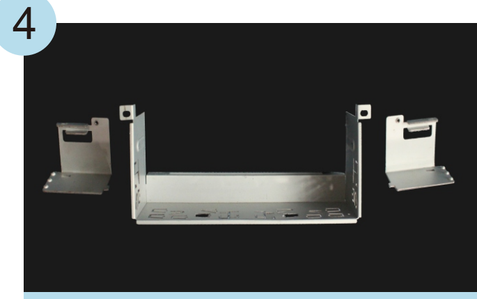
The metal part be need.