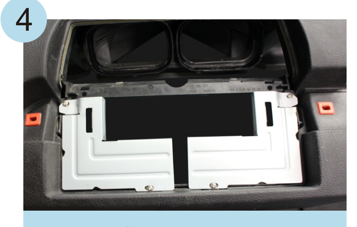
Put in and fix the metal part in the car.