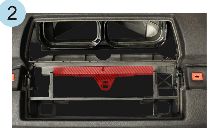
Cut the plastic part as marked in the picture.