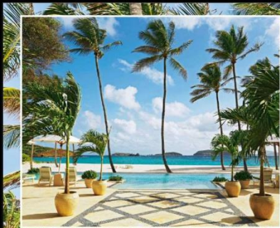
With a blue water and stone surround, the arch frame, the swimming pool features the natural surroundings (above). Getting Papi from back from the shorefront was important to Tommy as the family could stroll on the sand and enjoy the views around them without being the building's main feature.

with keeping your properties functional for your family and children? T: "Nothing is ever too precious for our family. The artwork is well hidden - or protected, should I say it's not that reachable. Functionality is our key. We use our homes, they are not museums or showcases. Two of our homes are on the beach, so that very much dictates the style." How do you spend your time here on Montserrat? What are your favourite activities? D: "One of the best things about Montserrat is that it's sports oriented. We are always hiking, paddle boarding, jogging, swimming, yoga, volleyball - you name it, we're doing it." "There's no distraction here, which is part of its magic. There are no shops and it's a very relaxed island lifestyle. The kids, of course, are left to