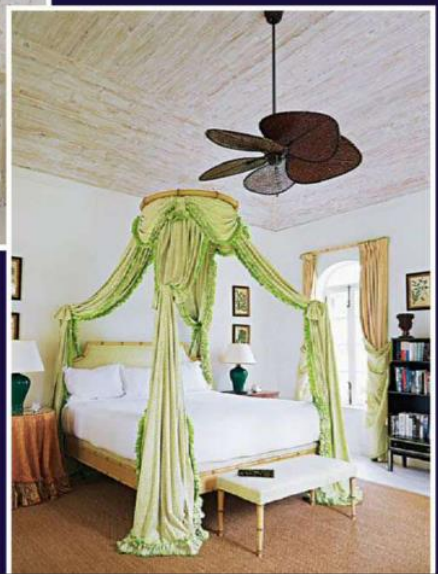
A palm-fringed white-sand beach is the perfect backdrop for lounging in the shade, as Dee proves (above). When the heat of the day becomes too much, she can seek refuge in one of the comfortable bedrooms, where large wooden fans (right) keep the warm air circulating. Not that Dee has much time for catnapping having launched her own luxury handbag (left) and lifestyle brand two years ago