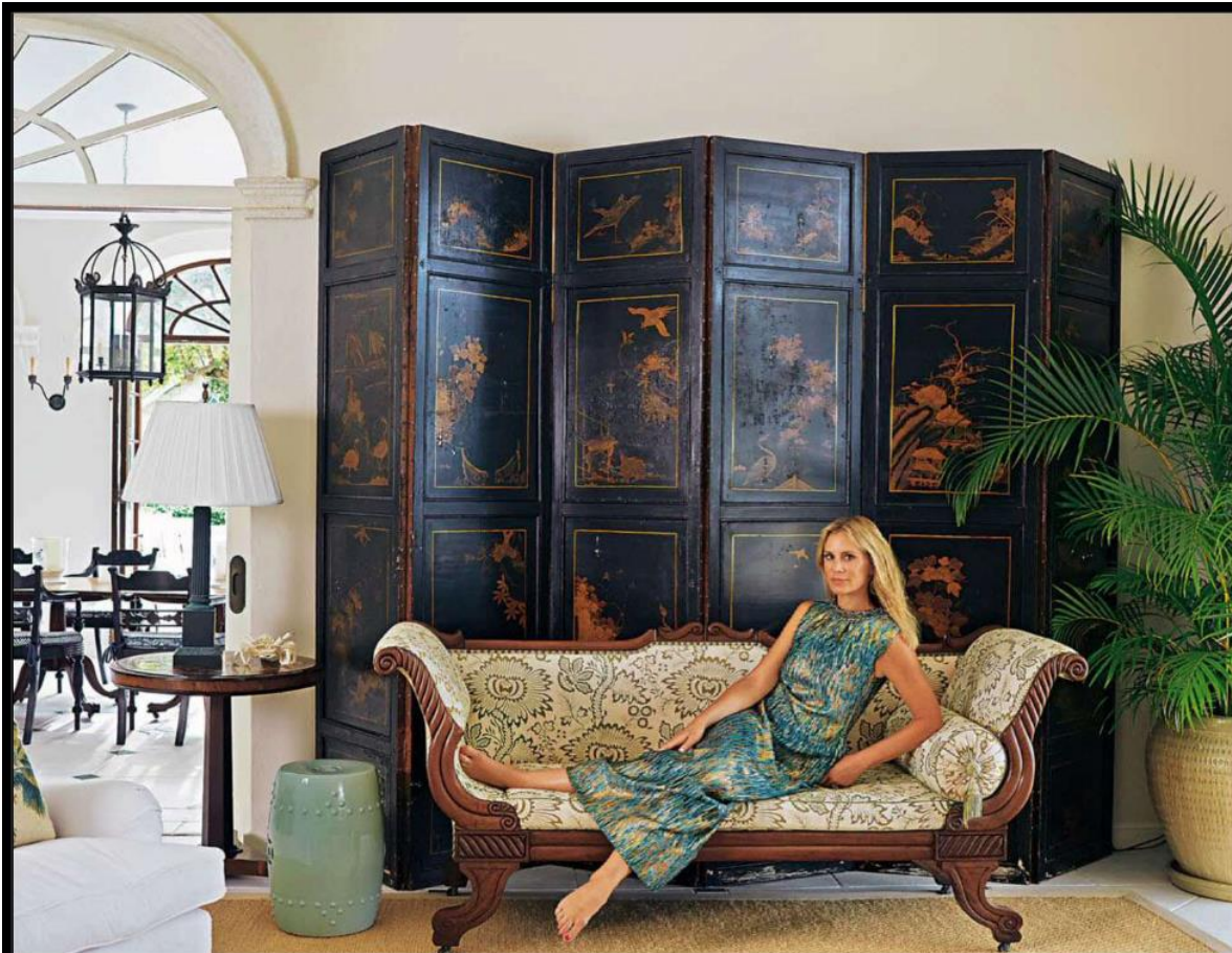
Tommy and Dee's Mustique home is a beautiful blend of formal and informal and a melting pot of influences, from the Asian touches in the furniture in a sitting room (above) to the sophisticated European-style stone and marble staircase