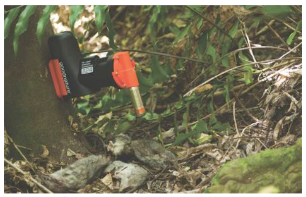
<u>www.goodnature.co.nz</u> Goodnature A24 rat & stoat trap