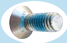
Lock Tight added to the Tray Bolt