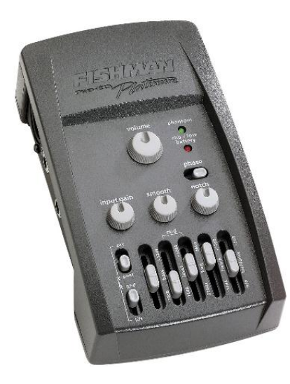
Fishman Pro EQ Platinum, an example of a Guitar Preamp

A guitar preamp lets you match a pickupt signal to a mixer input and modify the pickupt sound. The preamp amplifies a high-Z, unbalanced signal from a pickup, and provides a low-Z, balanced signal that lets you run a long cable from the stage to the mixer without degrading the sound.