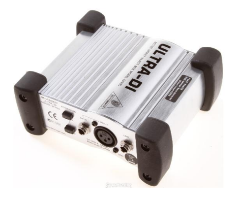
Behringer Ultra-DI, an example of an active direct box

The input impedance of a passive direct box is about 12 kilohms. It will work with a guitar pickup but is not ideal. The input impedance of an active direct box is