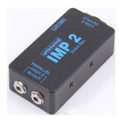
Whirlwind IMP 2, an example of a passive direct box.

A passive direct box has an impedance-matching transformer inside, but has no electronics. An active direct box has an FET (field-effect transistor) inside. It requires a battery or phantom power to operate.