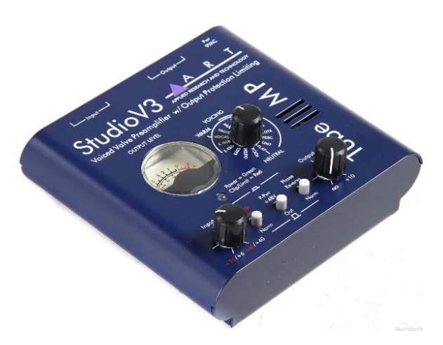
ART Studio V3, an example of a tube mic preamp

A mic preamp amplifies the weak signal from a microphone up to a stronger signal called % in e level+. It has a female XLR connector which you plug a mic into, and a male XLR connector or phone jack output which you connect to a line input on a mixer or audio interface.