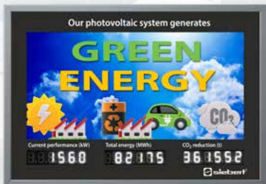
Series XC445 - for reading distances up to 10 m.