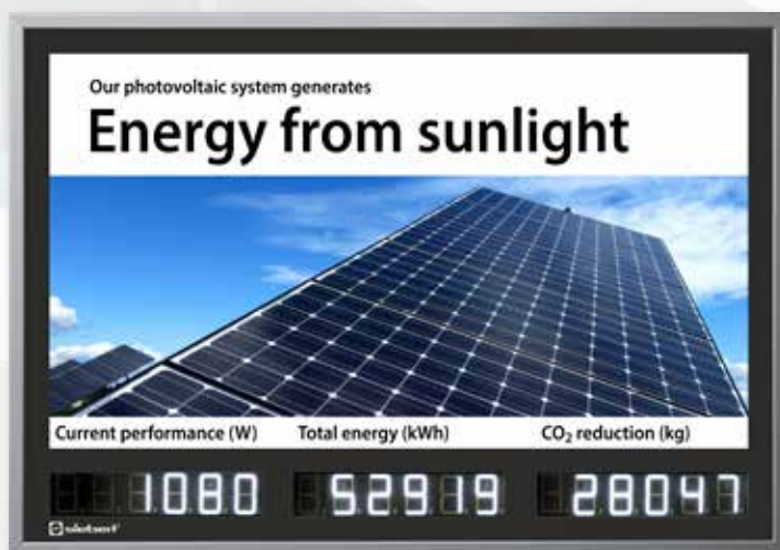
Series XC455 - for reading distances up to 20 m.