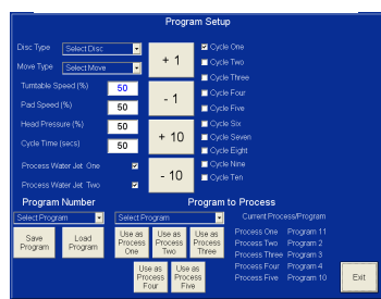
Finish Pattern Set Up Screen