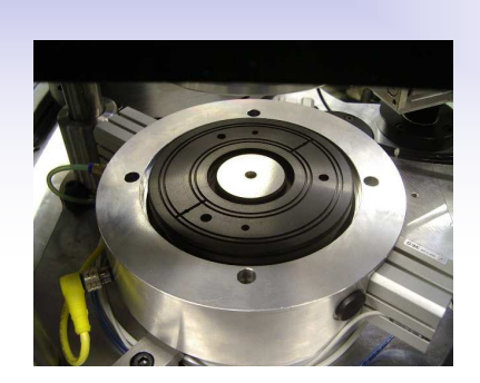
ID Punch and Die