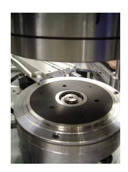
OD Punch and Die with stamper handling system