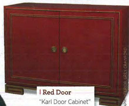
| Red Door "Karl Door Cabinet" from Lillian August for Hickory White ( lillianaugust.com )