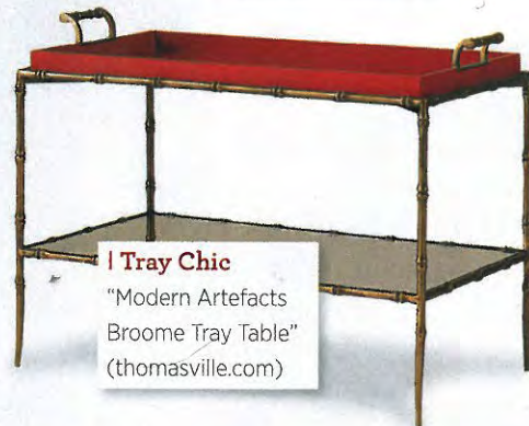
| Tray Chic "Modern Artefacts Broome Tray Table" (thomasville.com)