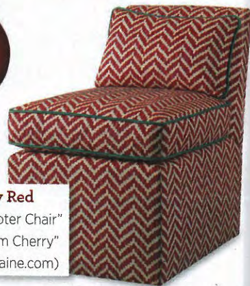
Chair-y Red "206 Scooter Chair" in "Rhythm Cherry" fabric