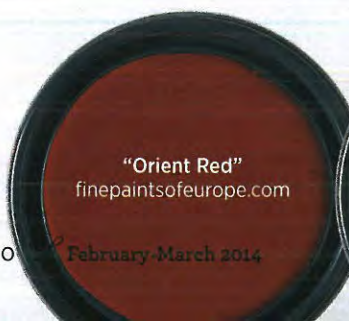
"Orient Red" finepaintsofeurope.com