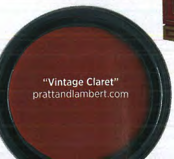
"Vintage Claret" prattandlambert.com