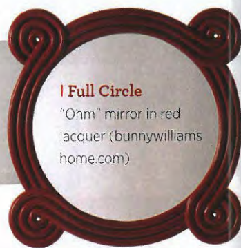
| Full Circle "Ohm" mirror in red lacquer (bunnywilliams home.com)