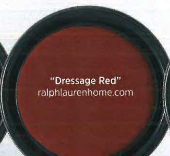
"Dressage Red" ralphlaurenhome.com