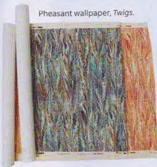
Pheasant wallpaper, Twigs.

Tozai Home's hand-blown glass vases in dusky shades of pink and cocoa look like cotton candy made vitreous, while fabric from Groundworks has the exotic allure and desert palette of shifting sand dunes. For a bigger statement, paper a room in Twigs' Pheasant wallpaper, which has the couture chic of a Missoni knit. Meanwhile, fashion designer Carlos Miele's collection of caftans is patterned in a whirling delirium of bottle green and goldfish orange. Billowing and diaphanous, they couldn't be lighter or breezier had they been loomed from floating clouds.