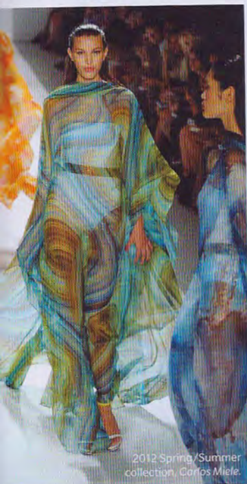
2012 Spring/Summer collection, Corpos Miele.