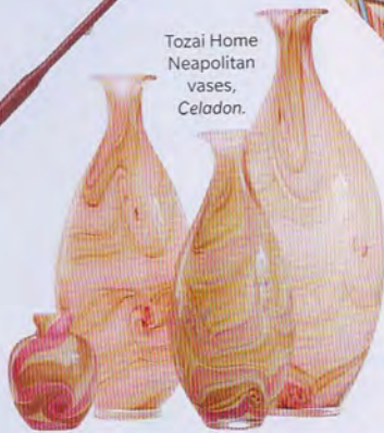
Tozai Home Neapolitan vases, Celadon.