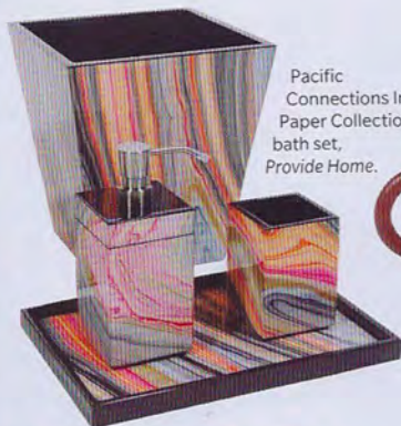
Pacific Connections Iris Paper Collection bath set, Provide Home.