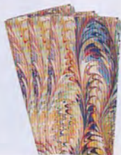
Florentine paper napkins, Dransfield & Ross.