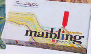
Marbling kit, The Paper Place.