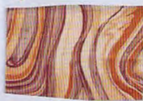
Barcelo fabric by Kelly Wearstler for Groundworks, Lee Jofa.