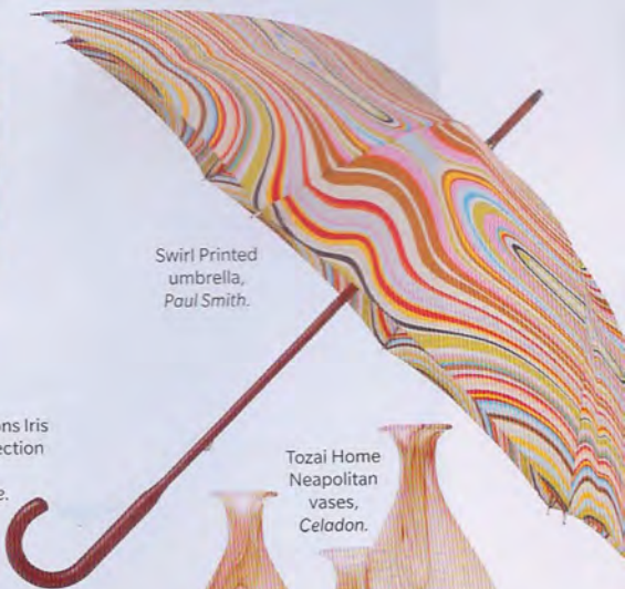
Swirl Printed umbrella, Paul Smith.