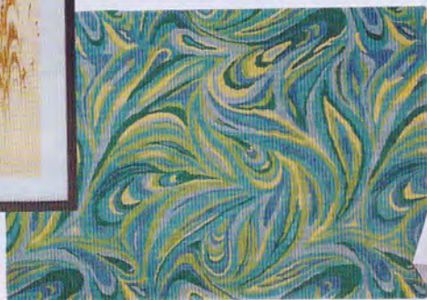
Marble rug, Company C.