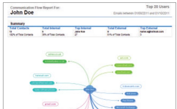
Identify business issues with Maillnsights reports

Download your free trial from: www.gfi.com/mailarchiver