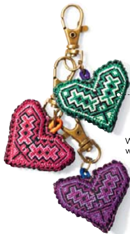
Heart key chains, $8 each, A Mano. Workshop, workshop-sf.com

(or hostess, or just-because) gift again. 600 Divisadero St., 415-863-3969, raredevice.net