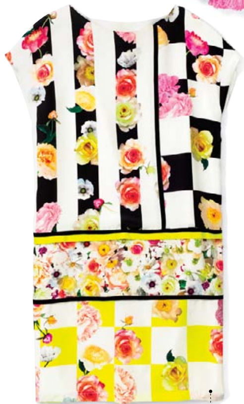
Silk dress, $845, MSGM. Nida, 415-552-4670