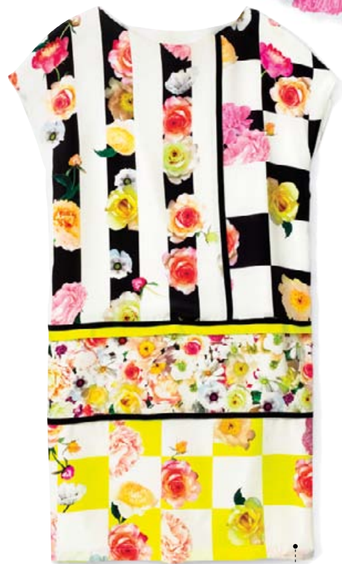
Silk dress, $845, MSGM. Nida, 415-552-4670

"Alba" necklace, $175, Studio Deseo. Reliquary, 415-431-4000