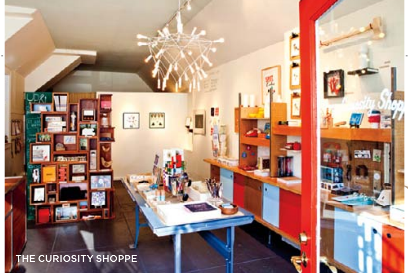
THE CURIOSITY SHOPPE

Picture a turn-of-the-century Oxford professor's study (antique typewriters