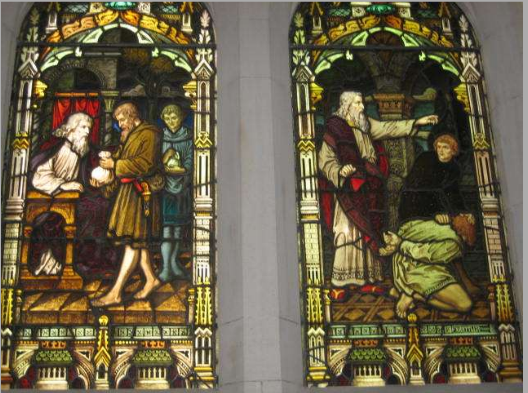
Parable of the Unmerciful Servant