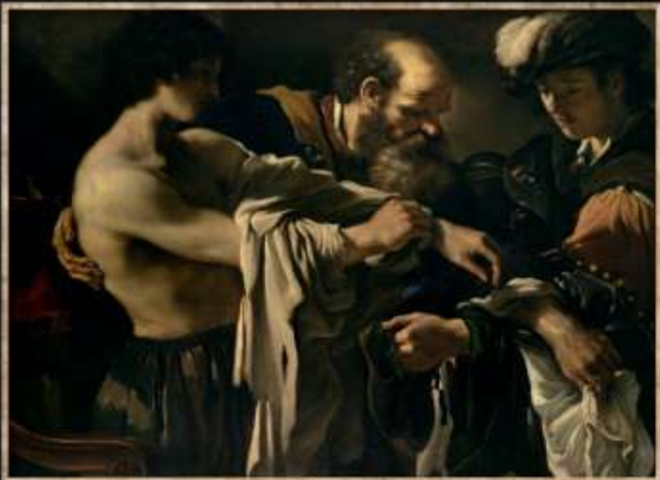
Giovanni Francesco Barbieri "Return of the Prodigal son," 1619