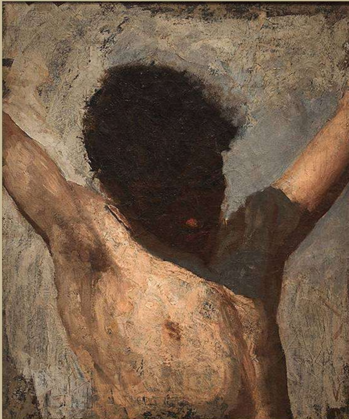
Eakins Crucifixion sketch