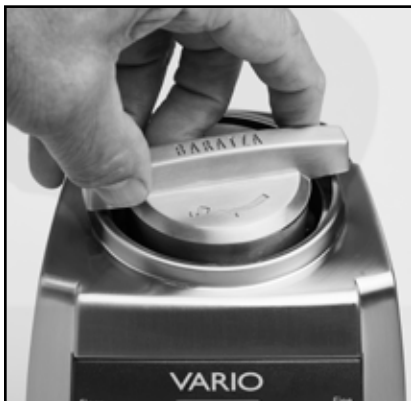
Rotate Baratza burr tool clockwise to remove the burr carrier.

Remove all the beans from the Bean Hopper. Rotate the hopper counter clockwise until it stops, lift the hopper off the grinder. Using the Baratza Burr Tool included with your grinder, rotate the metal burr carrier clockwise until it stops, then lift straight up and out of the grinder housing (wiggle the burr carrier if necessary to loosen it). The ceramic burr is mounted to the underside of the burr carrier. Clean the burr using a stiff brush. Use the bristle brush to remove any loose coffee residue on the fixed burr and the lower burr mounted within the motor housing.