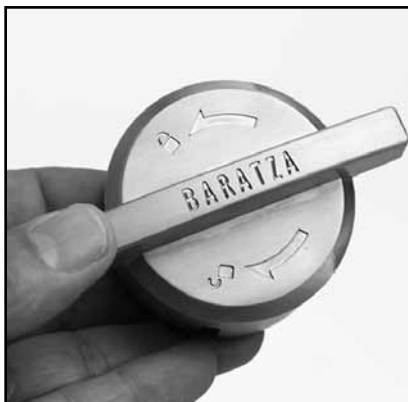
Rotate burr carrier counter clockwise to lock in place.

Wiggle and push down firmly on the burr carrier to ensure that it seats properly. Using the Baratza Burr Tool, rotate the burr carrier counter clockwise to lock in place. Note the lock icons and arrows on top of Baratza Burr Tool indicating direction to turn.