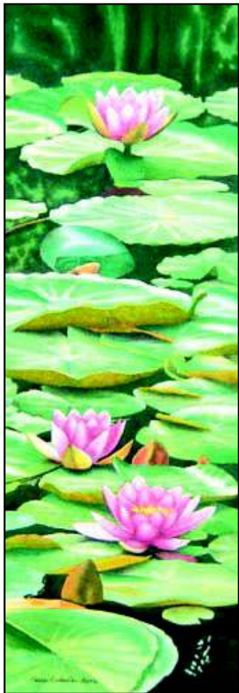
Blushing Beauties painted in 2006

Her voice fills with both excitement and intrigue as she recalls her recent travels to the Yukon and the North West Territories. "It's called the Serengeti