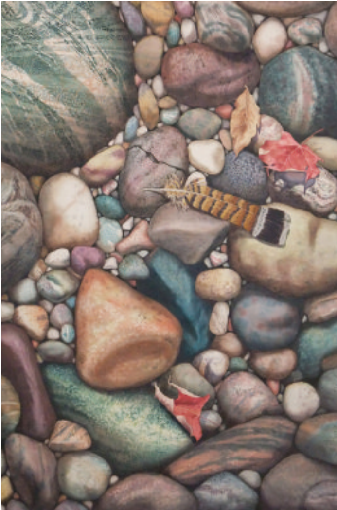
Watercolour on Paper: Beach Treasures, 20 x 16"

as they unfurl. Their travels have taken them from coast to coast, with Alaska, Yukon and the Northwest Territories, Newfoundland, Gaspé, Cuba, and the American Midwest having been targets for exploration.