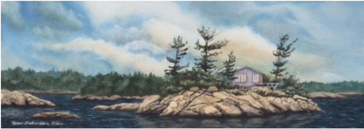
Watercolour on Paper: Island Retreat, 5 x 15"