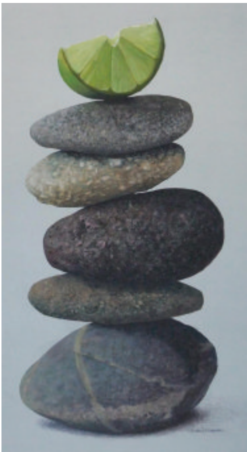
Acrylic on Canvas: Margarita on the Rocks, 24 x 12"