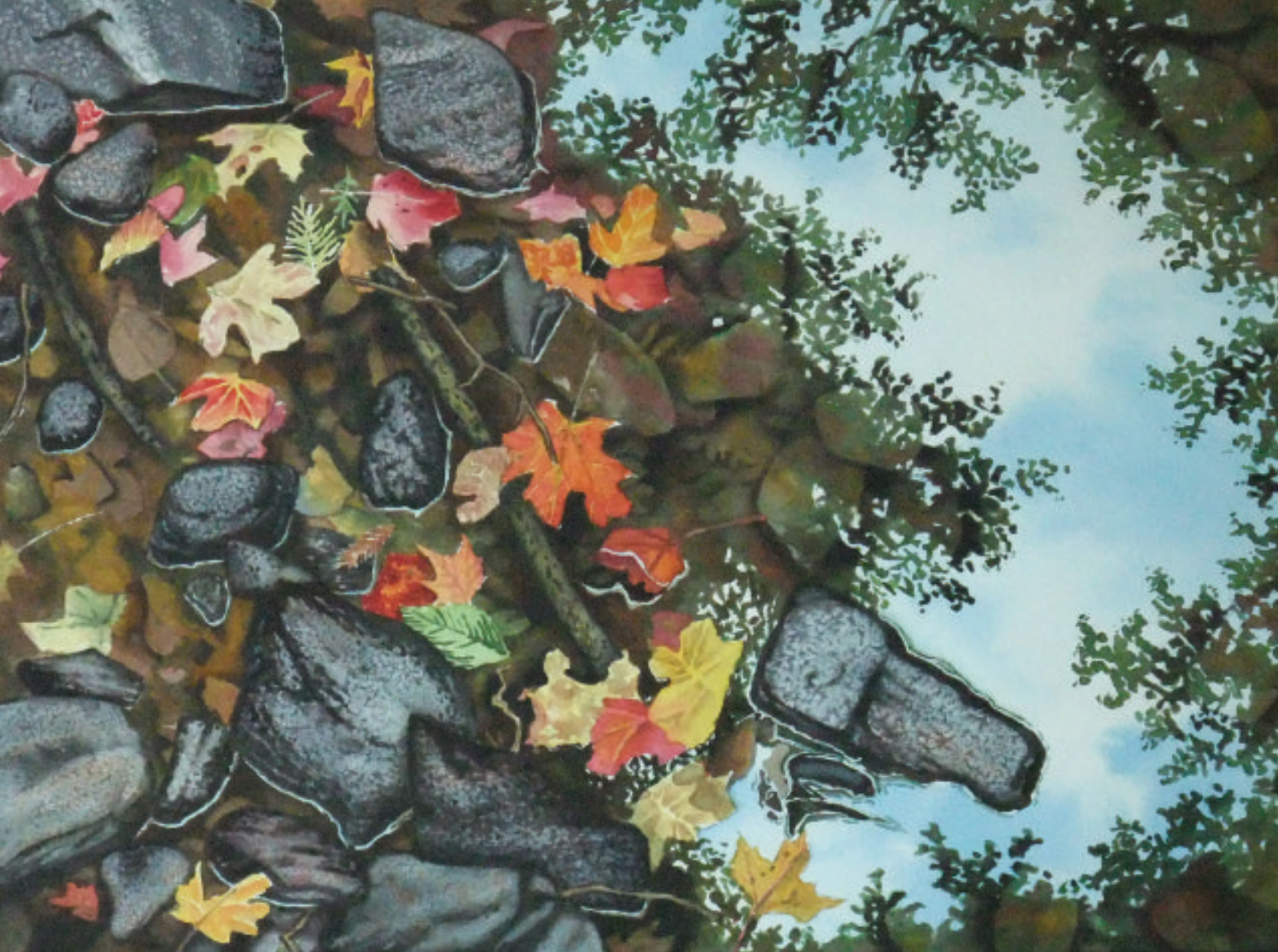
Watercolour on Paper: World At My Feet, 10 x 14"

has always been her preference. "Watercolour is known as a difficult media, but I don't find it so. Actually, what I enjoy about it is that you cannot totally control it; that's what keeps it interesting."