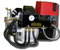
INOV8 model S200 (above) & Dual-fuel Model G200 (below)