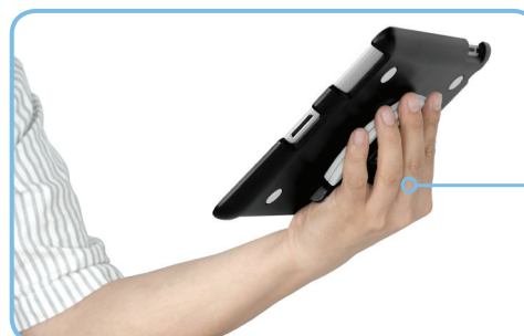
Easy to hold