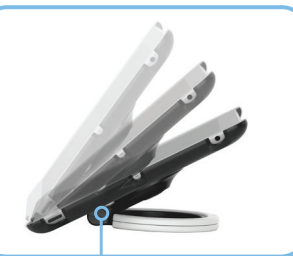
Easy viewing angle and height adjustment