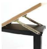
Optional manual tilt mechanism DM19 V-HEL