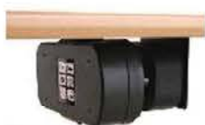
Optional battery pack BAT-24-1,7

Rectangular: Corner: 1200x800 1200x900 (90°) 1600x800 1560x1030 (120°)