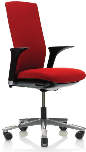
HÅG Futu 1020 w/optional armrests