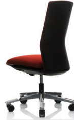
HÅG Futu 1020