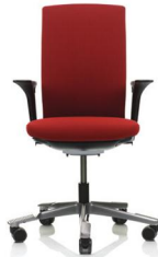
HÅG Futu 1020 w/optional armrests