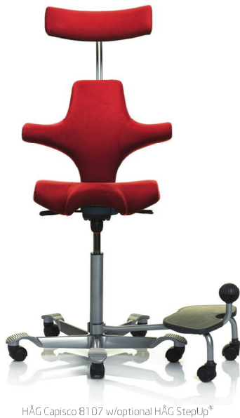
HÅG Capisco 8107 w/optional HÅG StepUp®