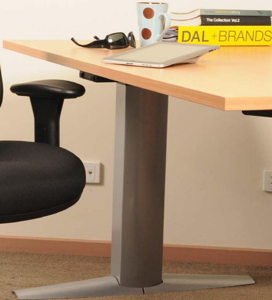
Swift High Back, Ergo Seat, Arms, 3 Lever with Seat Slider