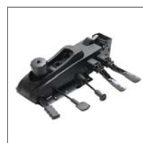
4 Lever Tilt Mech with Seat Slide