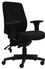
Spark High Back Square Seat, Arms