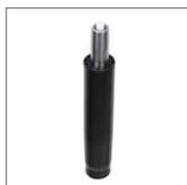
Standard 130mm Gas Lift