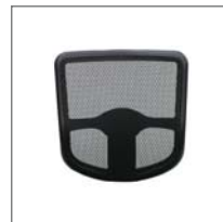
Swift Mid Back