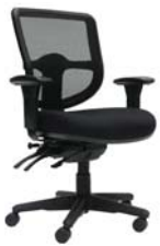
Swift Mid Back Ergo Seat, Arms