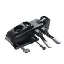
3 Lever Mech with Seat Slide