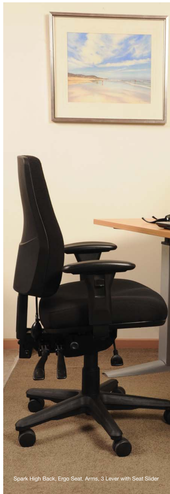
Spark High Back, Ergo Seat, Arms, 3 Lever with Seat Slider

Selected chairs within in the ErgoSelect range have been carefully chosen to achieve AFRDI level 6 accreditation for severe commercial use. The majority of components in all ErgoSelect chairs are however AFRDI level 6 certified and conform to AS/NZS4438-1997 ensuring you are purchasing a quality product designed to last.