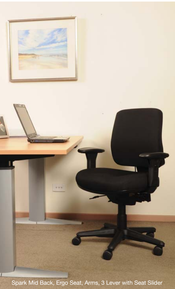
Spark Mid Back, Ergo Seat, Arms, 3 Lever with Seat Slider

Selected ErgoSelect Chairs are AFRDI Level 6 certified and GreenTag CERT™ certified. Please view our website www.dalseating.com.au for more information.