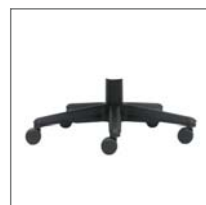
Black Nylon Base