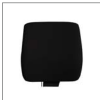
Spark Mid Back with Lumbar Pump