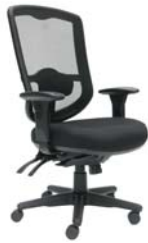
Swift High Back Ergo Seat, Arms