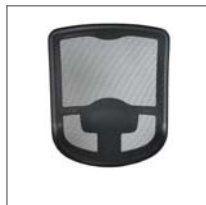
Swift High Back with Adjustable Lumbar