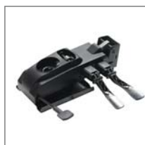
3 Lever Mechanism