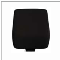
Spark High Back with Lumbar Pump