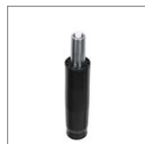
Low 100mm Gas Lift