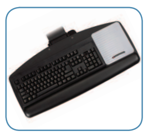
Standard platform accommodates both keyboard and mouse