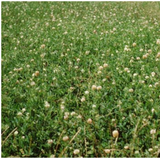
Figure 1 'Meechee' arrowleaf clover in flower.

Contributed by: USDA NRCS Jamie L. Whitten Plant Materials Center, Coffeeville, MS