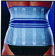
Bauerfeind Lumbo Loc