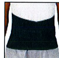
MedSpec Back-in-Black with Dual Panels