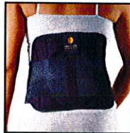
Corflex Disc Unloader

* Source: Bauerfeind Professional Pricing January 2012