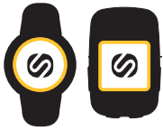
SOLEUS GPS DEVICE