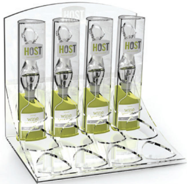
K2508 Point of Purchase Display

DISPLAYS FREE WITH FIRST PURCHASE OF 12 UNITS!