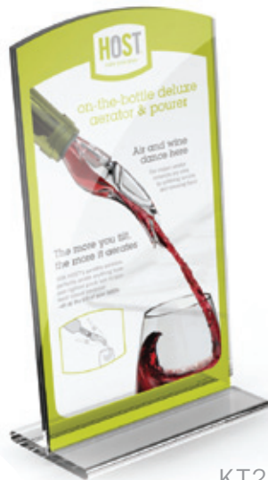
KT2508 Information Display