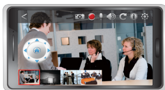
Free App with Remote Pan/Tilt