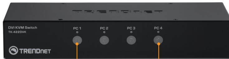
PC selector buttons