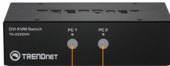
PC selector buttons