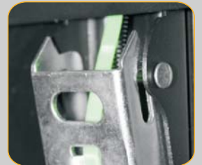
Verticals rails pull and unlocked designed