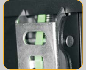
Verticals rails auto clicks and locked designed