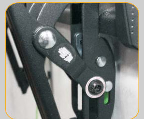
Hung free and stop at any point design is NB latest technology.