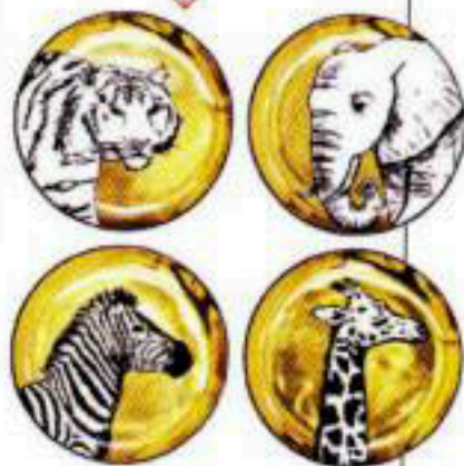
LAST CALL Jonathan Adler set of four Animalia coasters, $78. (jonathanadler.com)