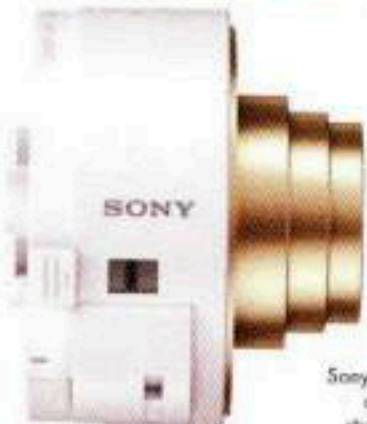
IN FOCUS Sony QX10 smartphone-attachable lens-style camera, $250. (sony.com)