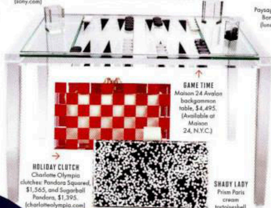
GAME TIME Maison 24 Avalon backgammon table, $4,495. (Available at Maison 24, N.Y.C.)