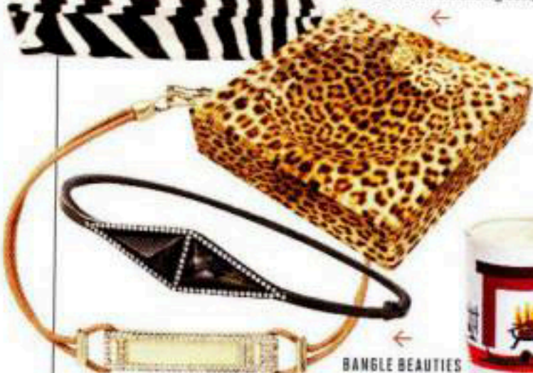
BANGLE BEAUTIES Monique Péan zebra agate bangle in white gold, $15,310; bracelet of leather and fossilized woolly mammoth with white-diamond pavé and white gold, $10,330. (moniquepean.com)