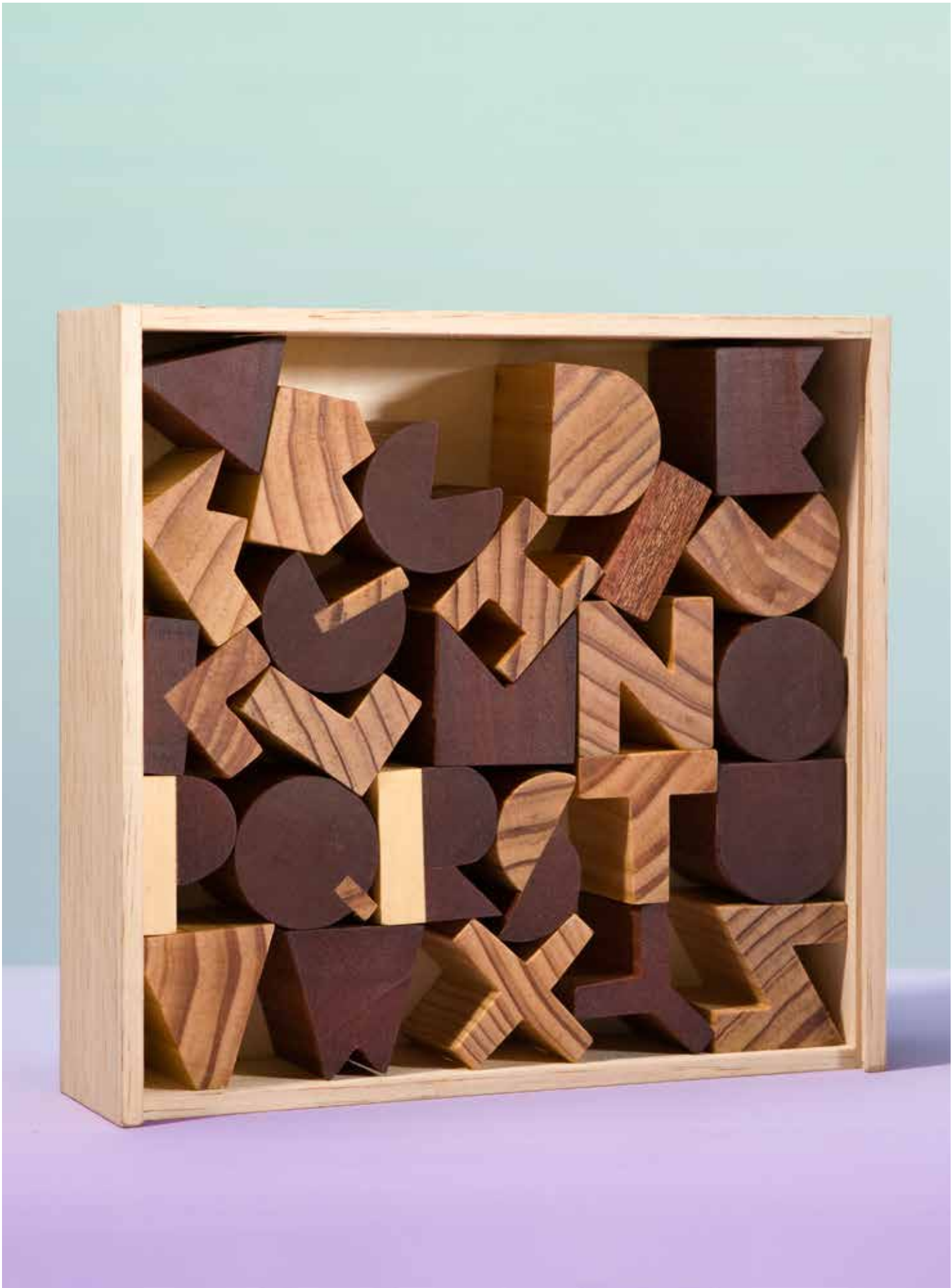
ALPHABET BLOCKS • Pat Kim Material: Pine and Mahogany ; box made from sustainably harvested Beech wood Dimensions: 10 x 10 x 2 inches; Each block is roughly 2 x 2 x 2 inches A meditation in wood of our twenty six letter alphabet. Great for stacking! Build your own letterscape. Perfect for the font enthusiast in your life.