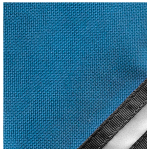
navy blue / black