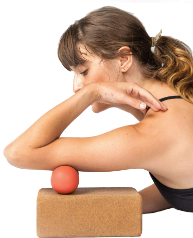
* Block Sold Seperately

Roll back and forth, stopping on any knots and using slow, circular motions to release them.