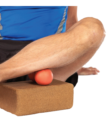
* Block Sold Seperately

Face a wall or pillar and hold the roller like you're holding a bottle of water. Start making small circles right below the outer edge of the collarbone and work down in the direction of the opposite hip.