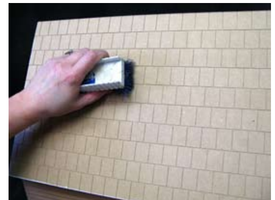
Cleaning with a stiff brush. Limpieza con un cepillo rígido.

The third coat is the tile color again, and will use all of the skill you developed on the first coat to keep paint out of the grooves. Keep the paint skimpy and the strokes dainty. A light, transparent coat gives the best product.