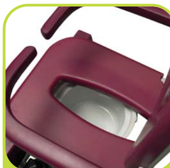
Padded seat back and armrests for added comfort