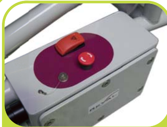
Waterproof control box with emergency stop button