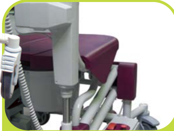
Powered tilt-in-space and seat height adjustment