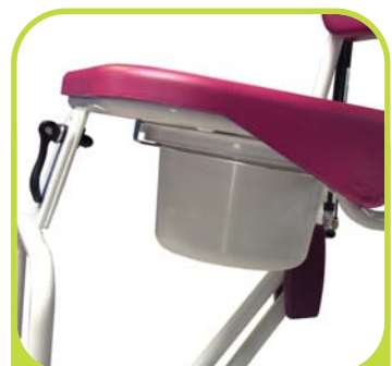
Soflex with commode pan option